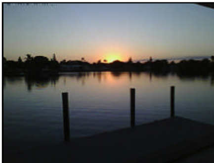
Sunset at Bay Haven, webcam picture.

We have a rental property on Anna Maria Island that is located on a small bay within the island, Bimini Bay. It occurred to me that having a webcam facing the water might be a good addition to the property website. It also would satisfy my need to tinker with technology, a big motivator. Anyway, if you are interested in seeing "live" pictures click this link, http://goff-club.com/510A/webcam.html . If that doesn't work for some reason you can copy the link and paste it in the address block of your browser.